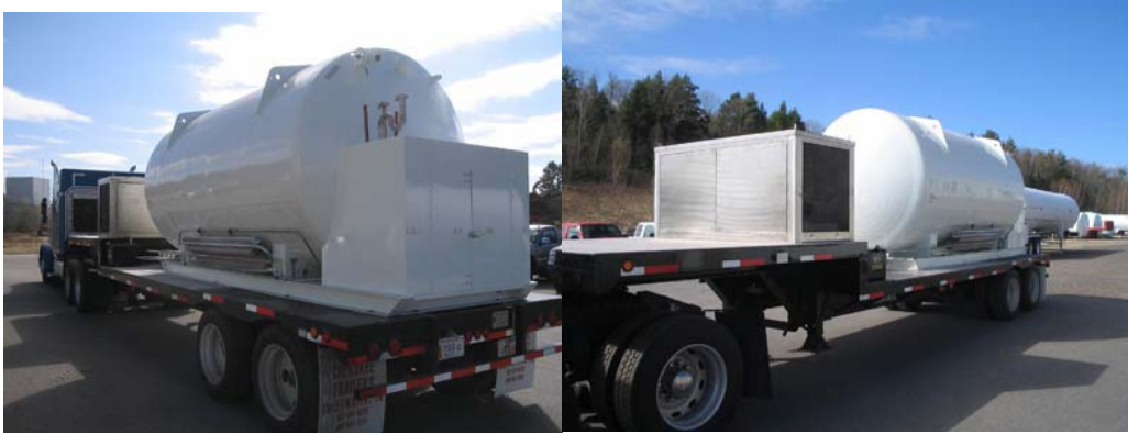
Self Contained Transport Unit With Generator Package