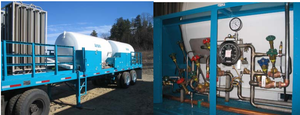
Portable Customer Station