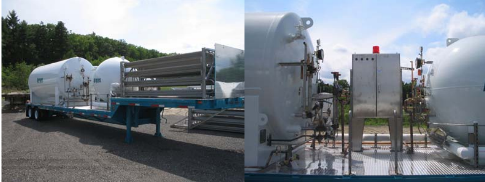
Emergency Hospital Delivery Unit